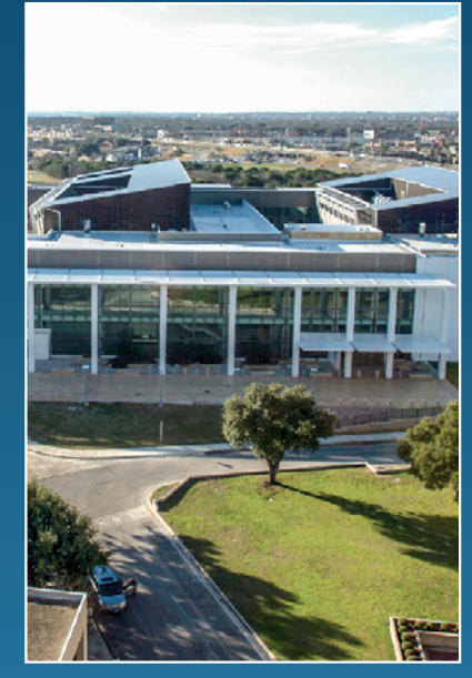
06. Military Construction