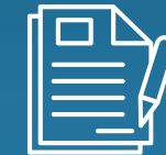
Contract & Subcontract Facilitation