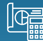
Estimation & Quantity Takeoffs