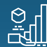
Earned Value Management