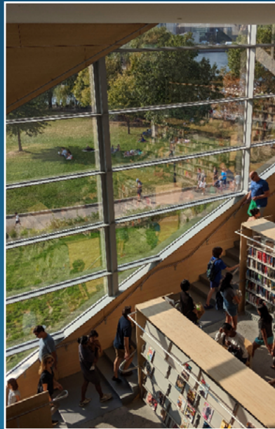
08. Educational and Cultural Centres