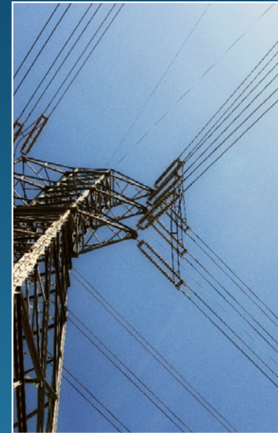
04. Power Utilities