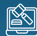
E-Procurement & E-Bidding