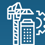
Building Information Modeling (BIM)