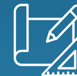
Design & Construction Process Management