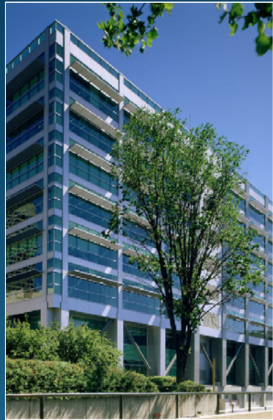
01. Federal and Public Buildings