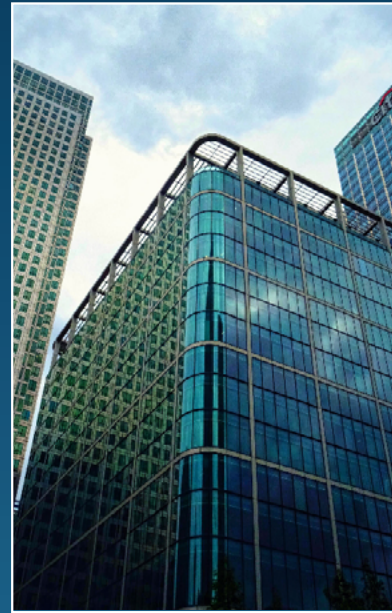
03. Residential Buildings